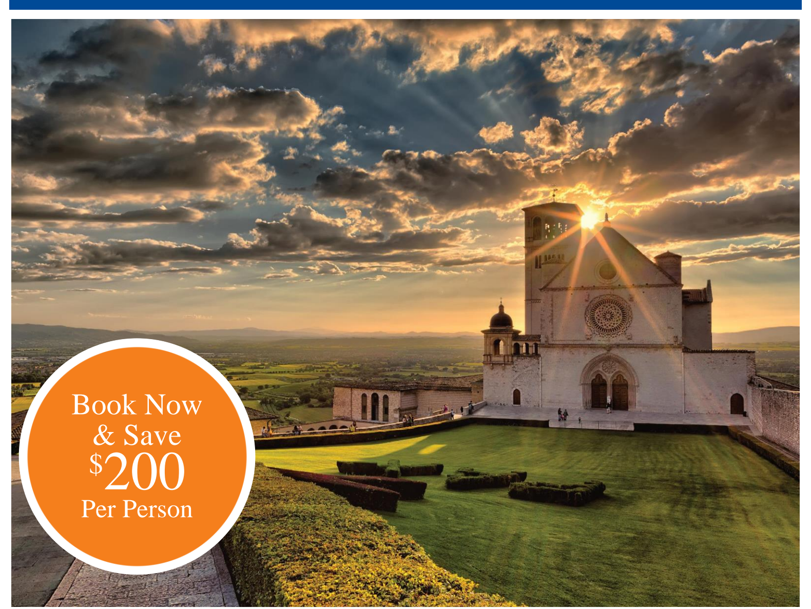
Upgrade to Elite Airfare! see inside for details

September 24 – October 4, 2024 Travel with Father Tim Hepner