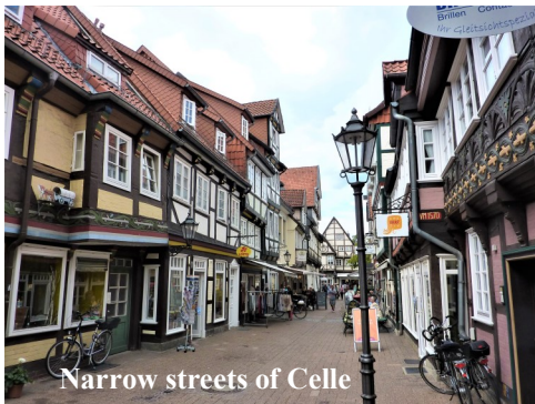
Narrow streets of Celle

A delightfully paced optional post tour to the Black Forest in Germany's southwestern corner includes a two night stay in Tübingen as well as overnights in Heidelberg and Frankfurt. Awake each day to the smell of the dense evergreen forests before heading to castles, waterfalls, a medieval monastery, wine tasting and some time to shop for local crafts. Tour highlights include the UNESCO World Heritage university city of Heidelberg.