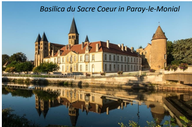
Basilica du Sacre Coeur in Paray-le-Monial

The land only price for the nine-night tour is $3,199.00 per person and the pre-tour is $1,375.00 per person both based on cash pricing and double occupancy.