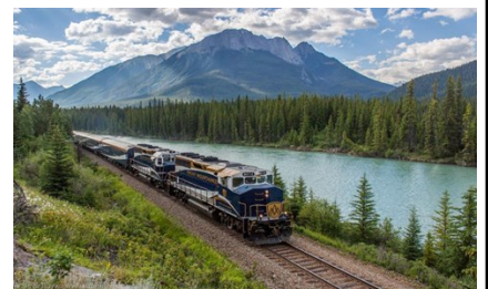
THOMPSON RIVER GLOBUS family of brands

Vancouver to Vancouver - The craggy mountains, waterfalls, and rushing streams of the Canadian Rockies are the backdrop for this exhilarating rail and coach vacation. Surrounded by stunning natural beauty, we begin and end our journey in cosmopolitan Vancouver, British Columbia. Our luxury tour features Fairmont Hotels and the famous Rocky Mountaineer Railway.