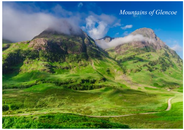
Mountains of Glencoe

Making our way North this morning through The Trossachs National