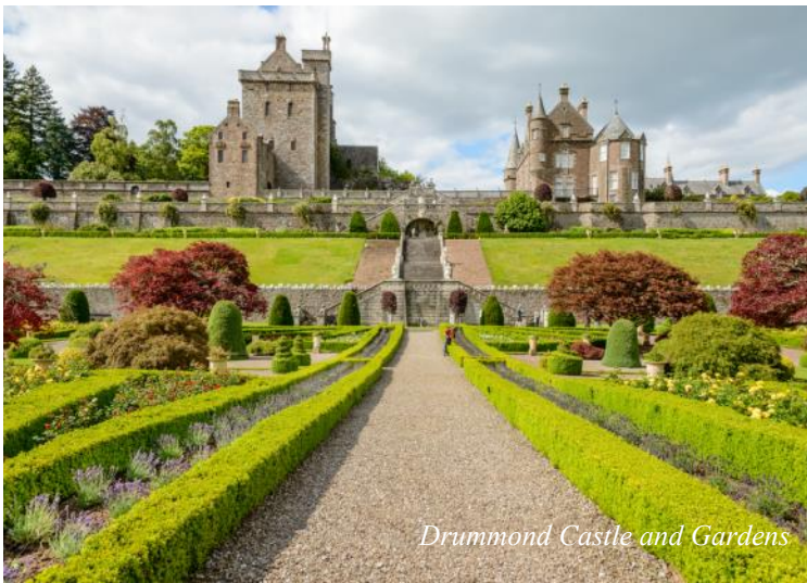
Drummond Castle and Gardens