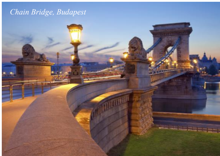
Chain Bridge, Budapest

We check out from our hotel this morning and travel to Kutna Hora also known as the city of silver. We see the Church of St. Barbara, a jewel of the late gothic period and also visit Sedlec Ossuary, a chapel that contains human bones that are artistically arranged to form decorations and furnishings. After lunch on our own we continue to Valtice in South Moravia, a vintners' center since Roman times. We enjoy a