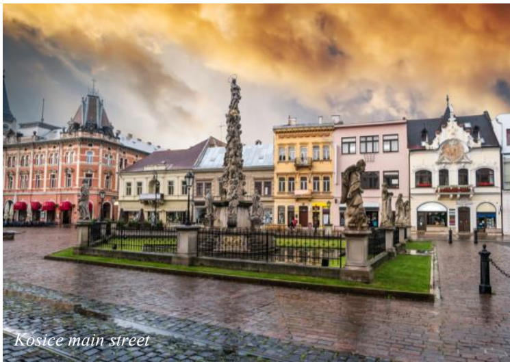
Kosice main street

trick horseback riders and beautiful steeds. Afterwards, we are treated to a traditional Hungarian meal and entertainment. Our final destination today is Kecskemét, a small town surrounded by vineyards and fruit trees, and famous for its art nouveau architecture and apricot brandy that we get to taste! We then return back to Budapest. B, L