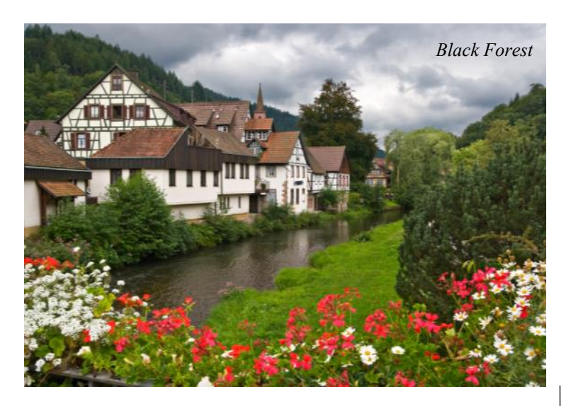
Day 1: Thursday, July 12, 2018 • Depart US Our heritage four begins as we hoard our transatlant

Our heritage tour begins as we board our transatlantic flight to Stuttgart, Germany.