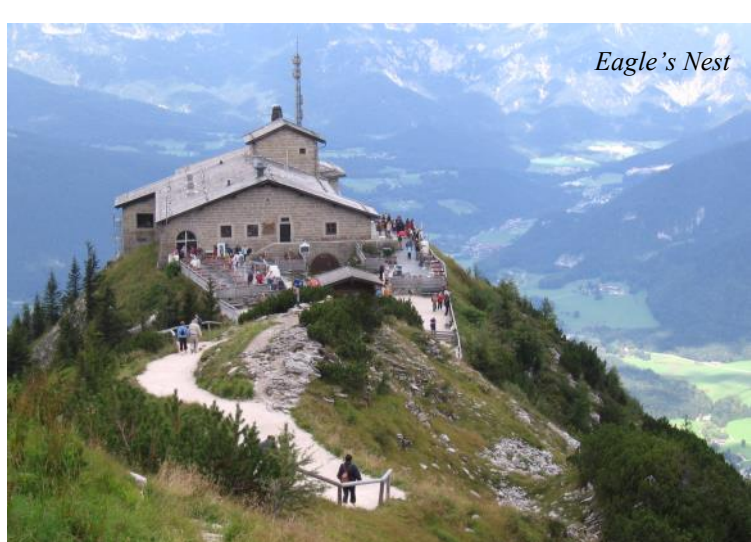
Day 6: Tuesday, July 17, 2018 • Lake Constance area

Today we enjoy an excursion via cogwheel train from Lauterbrunnen (the "village of the waterfalls") to the Kleine Scheidegg for a panoramic view of the Eiger, Mönch and Jungfrau mountains! After time for lunch on our own, we continue our train ride down the other side of the mountain to Grindelwald (the "village of the glaciers")! Our last train ride takes us back to Interlaken. Included in our excursion is a visit to Lauterbrunnen waterfalls. B, D